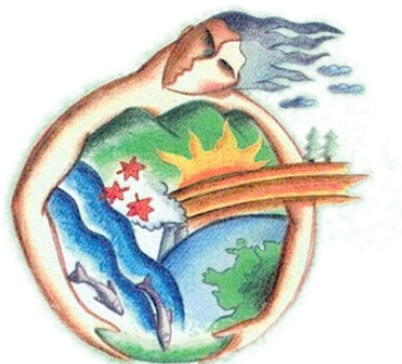
Original SW Logo

Throughout the period social media and our website promoted a wide range of stories: the winners of the 2022 Global Citizenship Competition with schools, Gorwelion readings events, regular Green Room events and community meet ups.